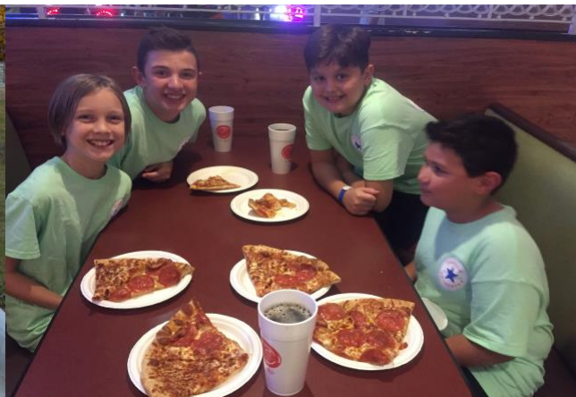
Orchestra is a family! We have fun together!