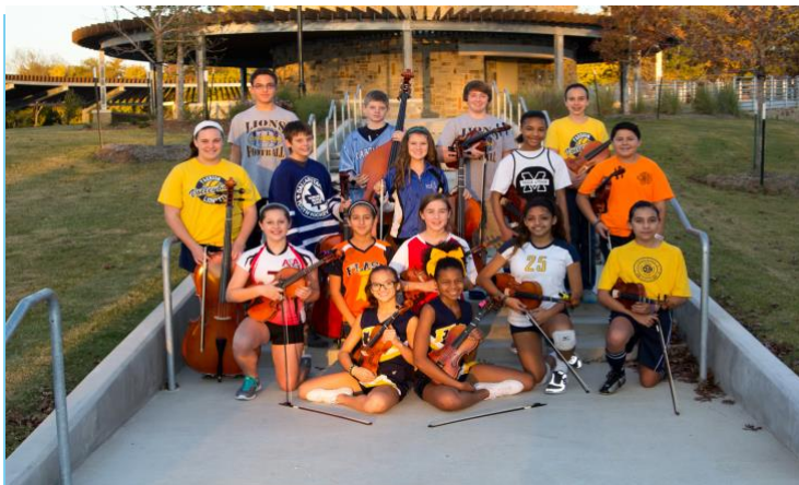
Students CAN be in athletics well as orchestra